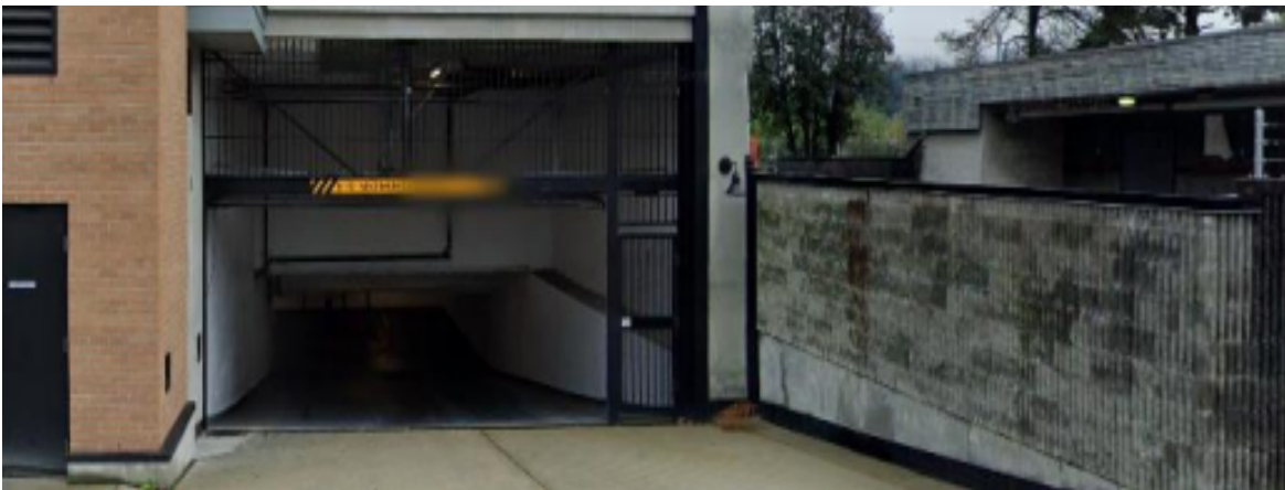
Image: Parking garage on Clark St.

https://docs.google.com/forms/d/e/1FAIpQLScrYO2LySBDGBTP5zd3wIKHucR-QaGx7Zlg-hHLfprL0ppe4Q/viewform