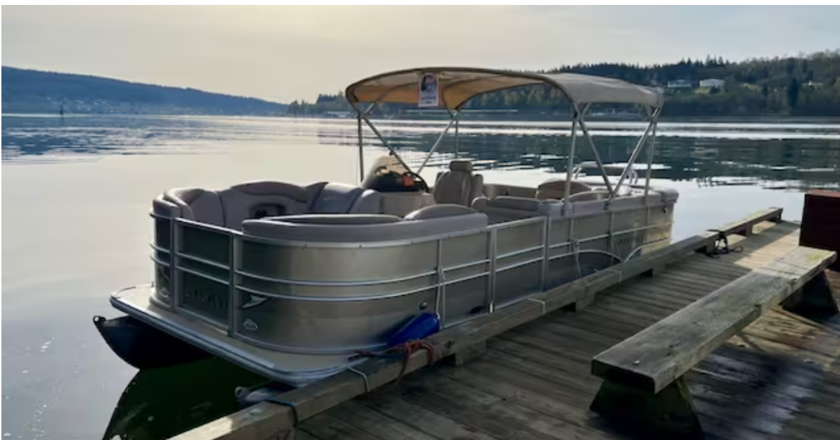
Image: Pontoon Shuttle Boat

Please note that you will see 2 docks at the Rocky Point Boat Launch. The pontoon shuttle boat may arrive at a different dock each day, depending on the ocean tide.