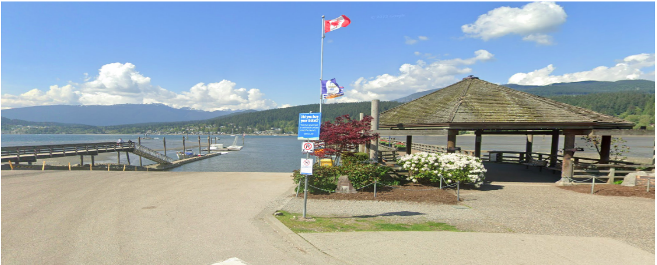
Image: Kiosk for luggage & guest drop-off

If you are parking a vehicle, you may first drop off your guests and luggage at the kiosk next to the docks at the Rocky Point Boat Launch.