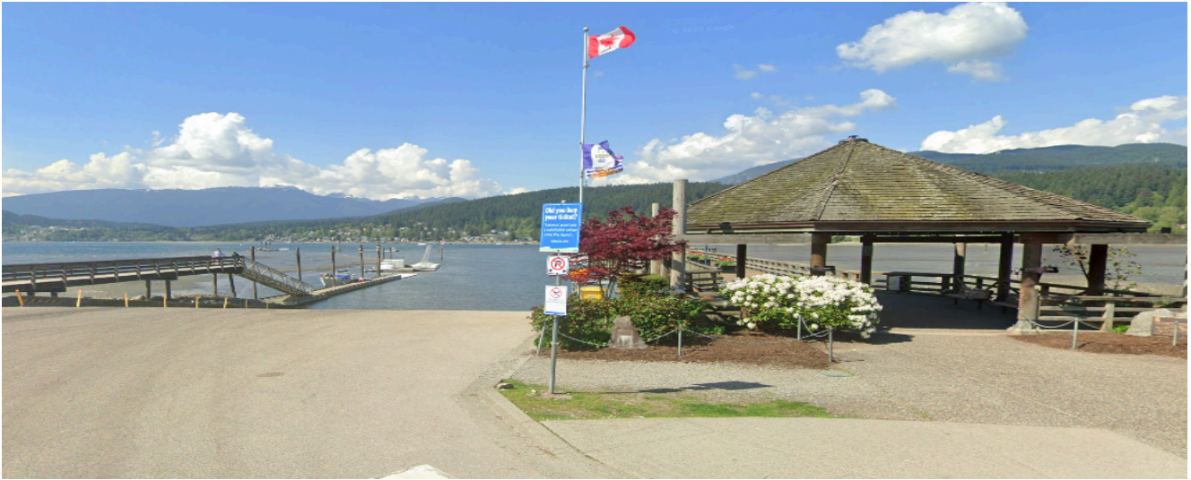
Image: Kiosk for luggage & guest drop-off

If you are parking a vehicle, you may first drop off your guests and luggage at the kiosk next to the docks at the Rocky Point Boat Launch.