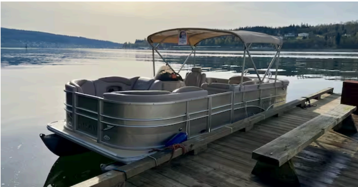
Image: Pontoon Shuttle Boat

Please note that you will see 2 docks at the Rocky Point Boat Launch. The pontoon shuttle boat may arrive at a different dock each day, depending on the ocean tide.