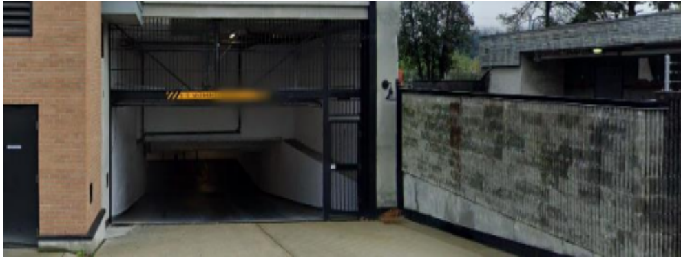
Image: Parking garage on Spring St.